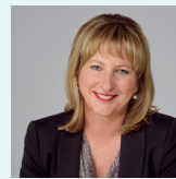
The Hon Gayle Tierney MP Minister for Skills and TAFE